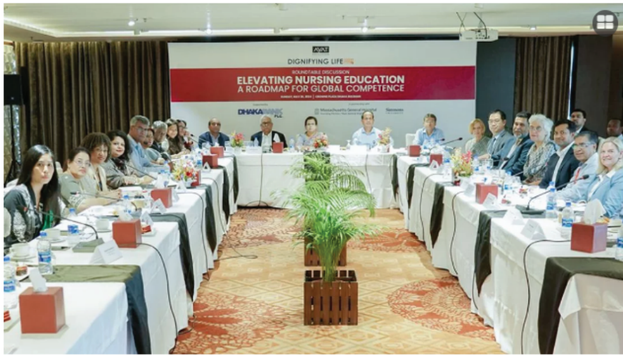
The image shows health experts are seen attending a roundtable discussion in Dhaka on Sunday, May 26, 2024.