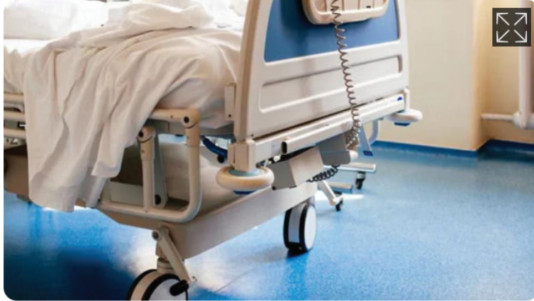
Those infected by Coronavirus could experience flu-like symptoms.

A four-day specialised training workshop was held for physicians and nurses to equip them with essential skills in palliative care.